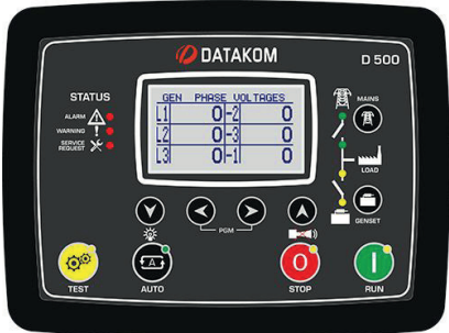
D-500LITE MK2 control operator / display panel